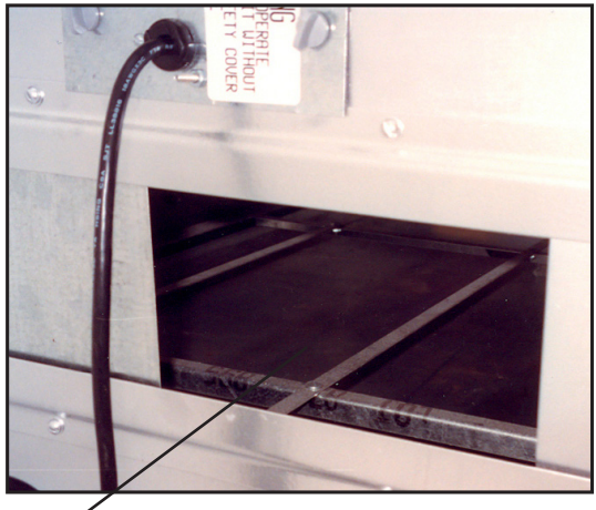
Rear Opening 14" x 4" (35.6 cm x 10.2 cm)